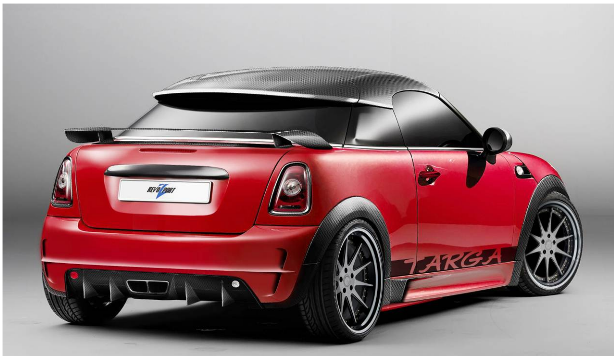
Targa Raze Mini Coupe & Roadster