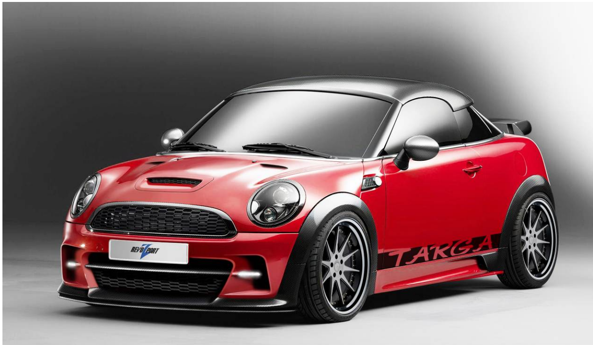
Targa Raze Mini Coupe & Roadster